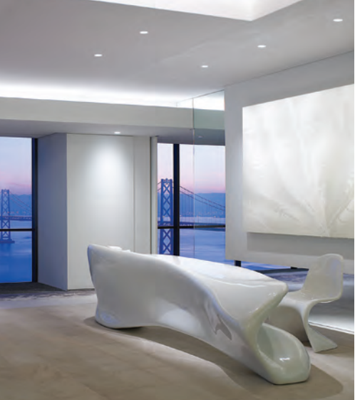
FRONT COVER: SILVER OAK WINERY - HEALDSBURG, CA Lighting Design: EJA