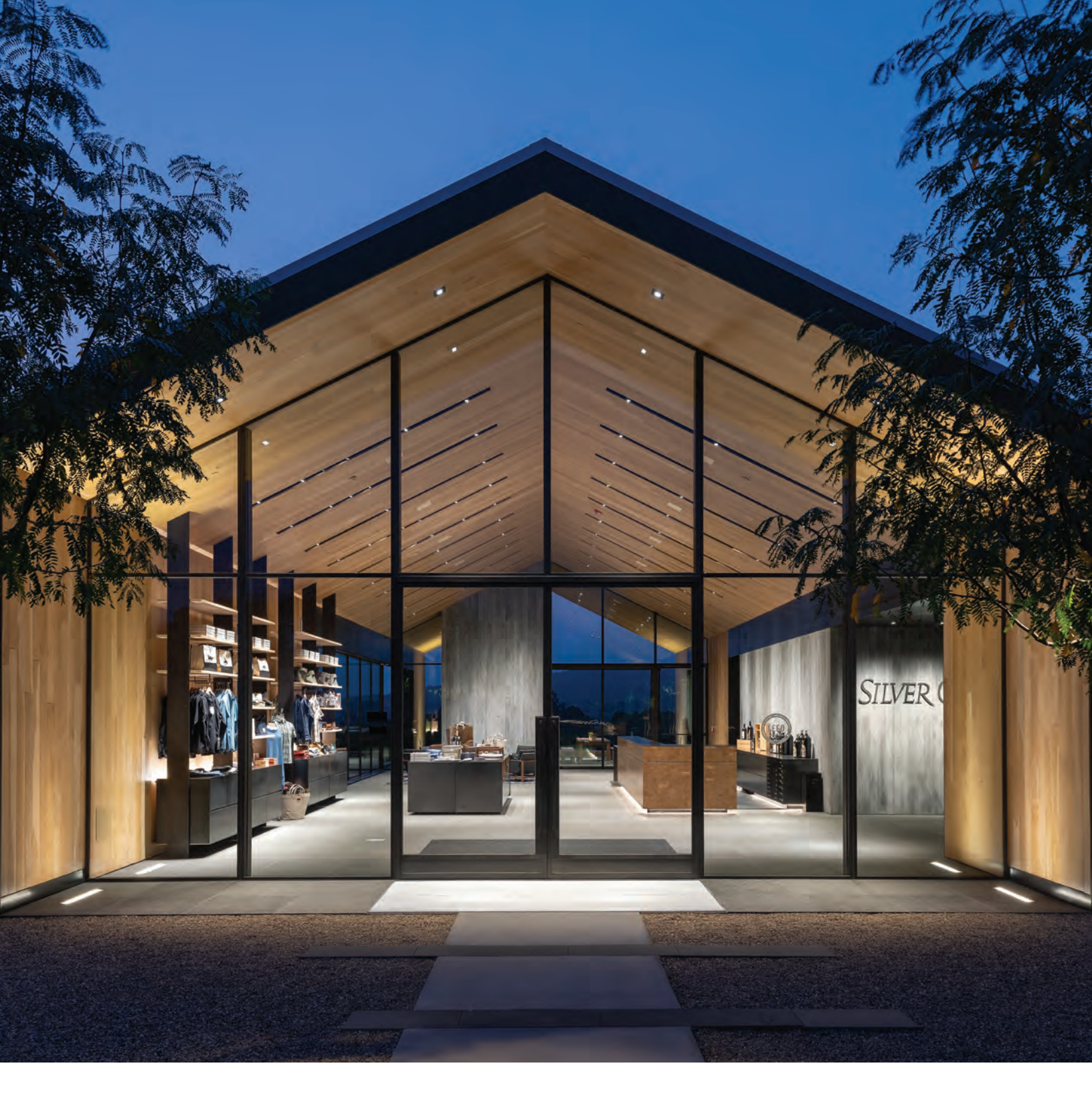
SUPERIOR LED LIGHTING SOLUTIONS TO FIT YOUR STYLE